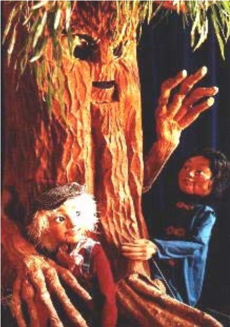
Illustrated with original and traditional fiddle music, this show features a huge Willow Tree pup-