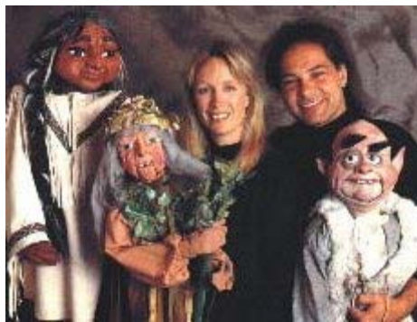
The Catskill Puppet Theater takes great pride in carrying on in the living tradition of the old traveling puppet troupes.